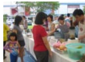
Smoothies fruit drinks

The sabbath afternoon was spent conducting health screening and enrollment to Pathway to Health courses. Our healthy booths even